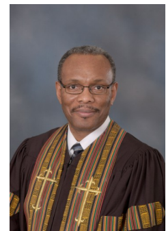
Grace and Peace

The Bible is filled with these inspiring stories. From them, we learn that when we live for Christ, our heart’s desire is to honor Him only. And success is the result.